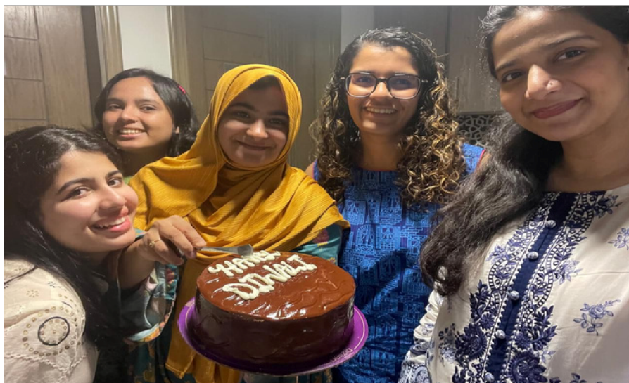
Our hard-working team celebrating Diwali!