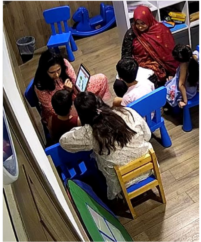
Group sessions with sensory play, waiting and turn taking!